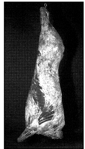
Figure 1: Dry aging of a beef carcass.

Dry aging (Figure 1) is the traditional process of placing an entire carcass or wholesale cut (without covering or packaging) in a refrigerated room for 21 to 28 days at 32-34° F and 80-85% relative humidity, with an air velocity of 0.5 to 2.5 m/sec. All three conditions, although varying widely in commercial practice, are extremely important in the proper postmortem aging of carcasses, as well as beef ribs and loins.